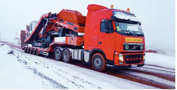
EASY TO TRANSPORT DUE TO FOLDABALITY BUILT FOR HARSH SITUATIONS INCLUDING EXTREME WEATHER CONDITIONS